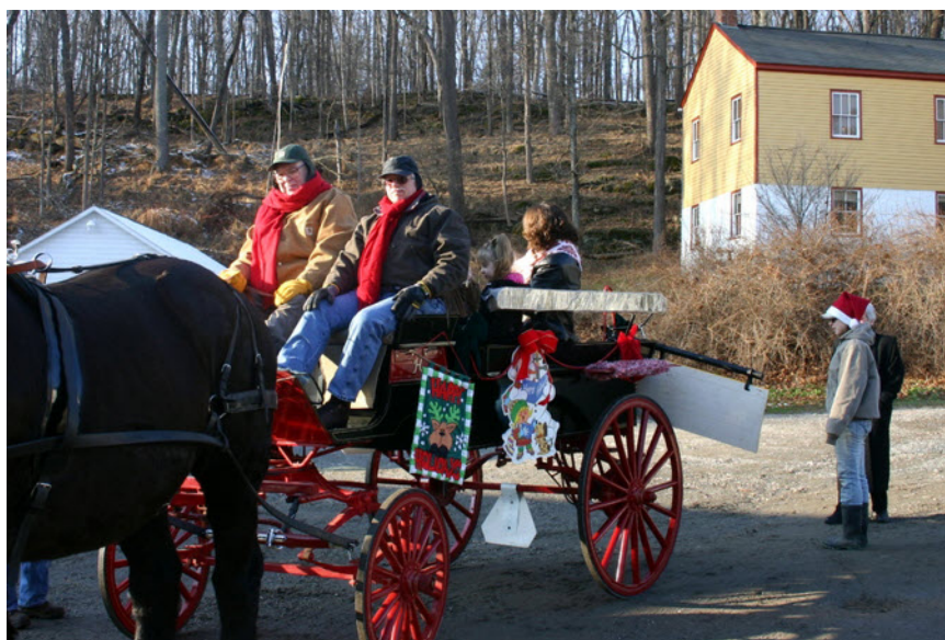
The weather was perfect for a good old-fashioned carriage ride.