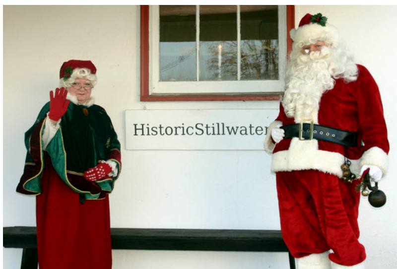
Christmas Greetings from the Claus Family