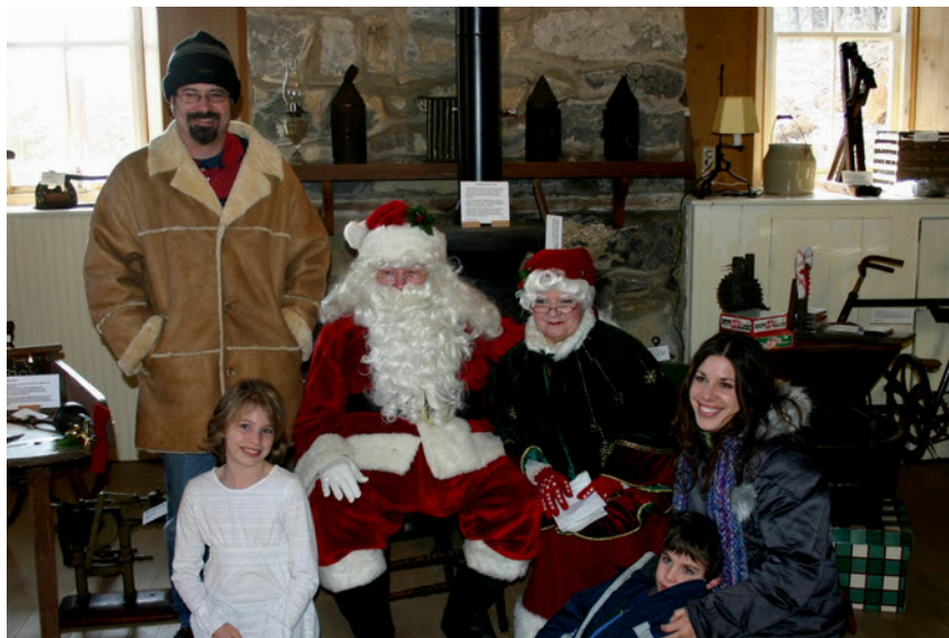
Santa and Mrs. Claus meet their fans.

On December 6, 2009, HSST held our annual Christmas Open House. Santa and Mrs. Claus were on hand to greet the kids and everyone enjoyed the refreshments. Best of all, we had a Bake Sale so folks could leave the party with that night's dessert in hand! All-in-all, it was a great way to spend a wintry Sunday afternoon and to get in the mood for the holidays.