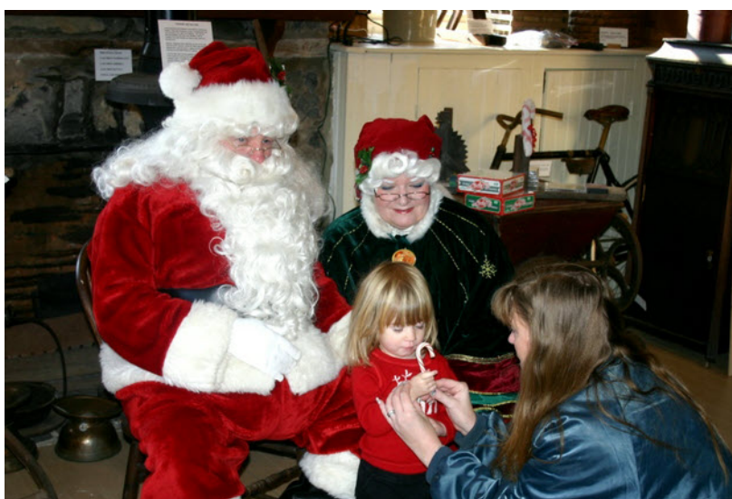
It wouldn't be Christmas without candy canes!