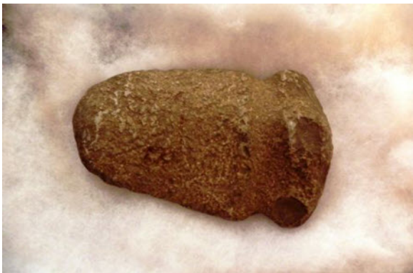
Gorget (ornamental piece worn around the neck; had a ceremonial purpose):