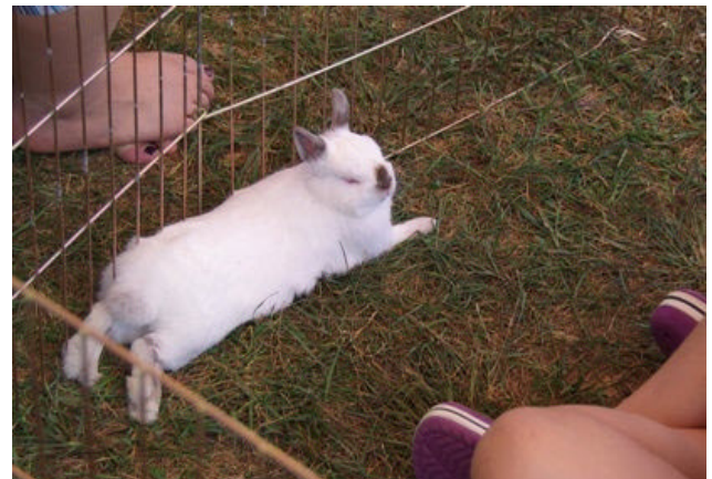
...and friends to meet.