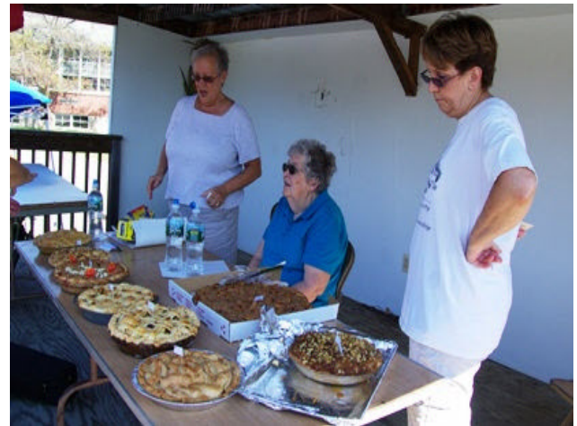
...and an apple pie contest, too.