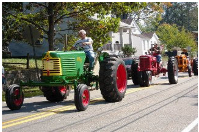
Next came the tractors.