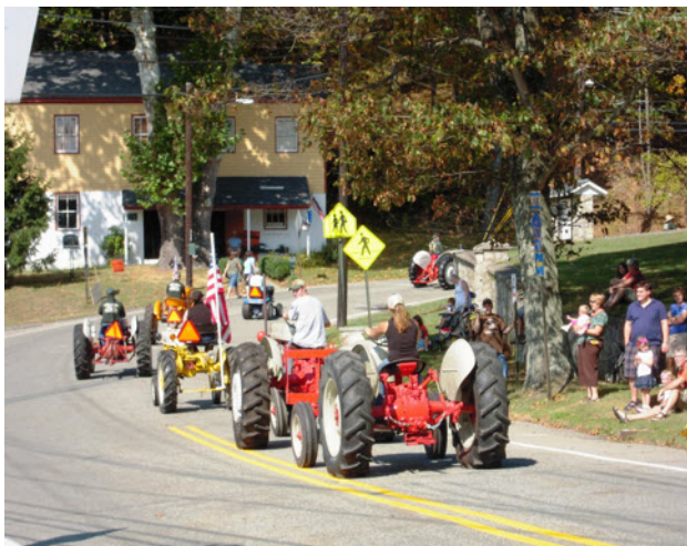
Past the museum...