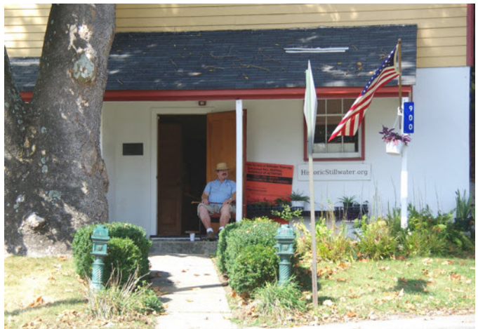
...which was open for tours.