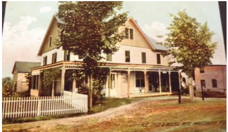
Swartswood Post Office and General Store: