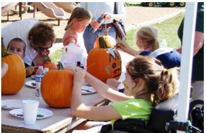
...and little crafters!