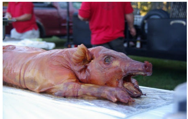
...there was more substantial fare, as well!