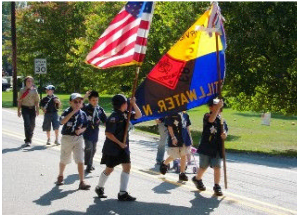
Boy Scouts on parade.

The Historical Society of Stillwater Township's 5th Annual Fall Festival, was held on September 25, 2010 in partnership with Stillwater's Recreation Commission. It was a record-breaking Fall Festival for HSST but, best of all, it was fun!