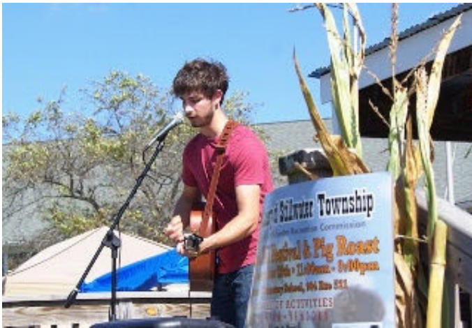
Of course, there was music...