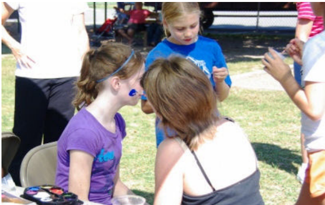
There were faces to paint...