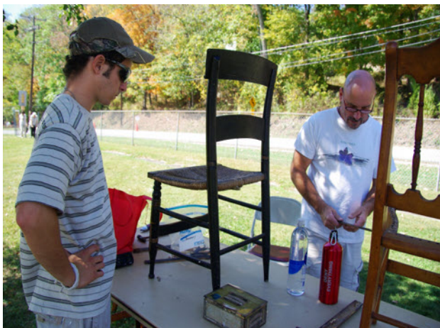
There were big crafters...