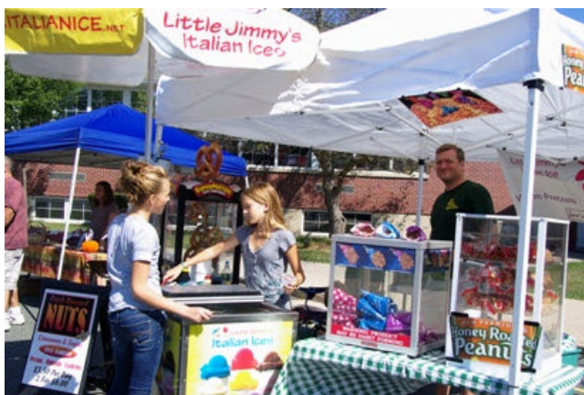
The snacks were tasty, but...